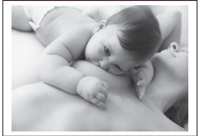
Figure 8. Babies can have a good latch in lots of positions. Mother and baby both look happy, and it's nice to see a mother and baby in a laid-back position.

out for. We can also use the poor images as powerful teaching tools. But first, we must pay attention. Bit by bit, we can help turn the tide for the mothers we work for, and hopefully, create more accurate and helpful materials than much of what is currently out there. We must also remember that some of this material is produced by groups that want breastfeeding to fail.