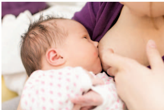
Figure 4. Another picture with a baby on her back. Please note that this is a bottle-feeding position. Her head is turned, and her latch looks pretty shallow. She also looks stressed. The mother might be as well.

Figure 3. There are a few problems here: shallow latch, bottom lip tucked in, and baby on her back with her head turned. I would anticipate problems with nipple pain, and possibly, milk supply/infant weight gain.