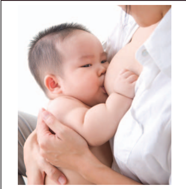
Figure 7. This latch looks a little shallow, but it is most likely fine. If it's not hurting the mother, we can leave it alone. The baby certainly isn't starving.

you need to ask next?" They would shout, "Does it hurt?" They were really engaged, and I think they retained the information much better than if I had stood there and lectured them.