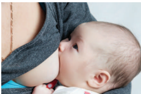
Figure 6. This is another lovely photo of decent latch, and the mother and baby enjoying each other. The baby certainly appears happy.

Figure 5. This one looks better, although we cannot see the bottom lip. The baby does not appear stressed and is in a state of quiet alertness. That's what we like to see.