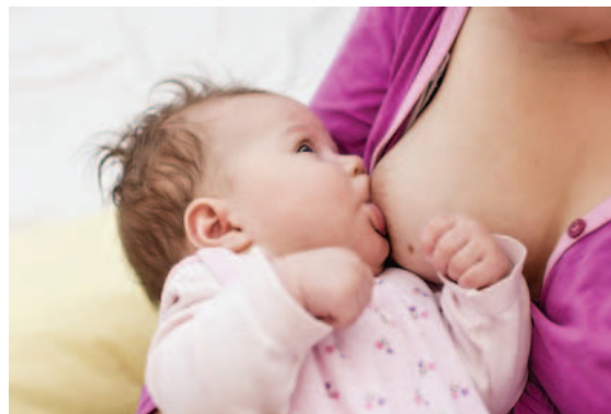
Figure 5. This one looks better, although we cannot see the bottom lip. The baby does not appear stressed and is in a state of quiet alertness. That's what we like to see.

Figure 4. Another picture with a baby on her back. Please note that this is a bottle-feeding position. Her head is turned, and her latch looks pretty shallow. She also looks stressed. The mother might be as well.